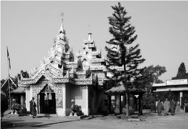
Figure v-3. Rajbana Vihara, Rangamati, Chittagong. (Public domain)

The Möbius band and Klein bottle can be seen as precursors to fractal geometry. They are paradoxical, interdimensional objects with the concept of infinity implicitly tucked into their infinitely stretchable, topological spaces. By contrast, fractal geometry utilizes infinity more explicitly within the new concept of fractal dimensionality. The infinite stretch between ordinary dimensions is what renders fractal objects ideal for incorporation into religious architecture and art. To behold a progression of self-similar steeples as they unfold upwards from a Buddhist temple (see Figure v-3) is to get an embodied feel for fractals as grounded in the finite realm of matter, while stretching towards the infinite realm of spirit.